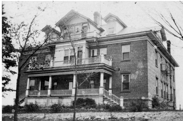
Poorhouses were common enough that they often appeared in offensive, idealized, or ominous early-twentieth-century postcards.